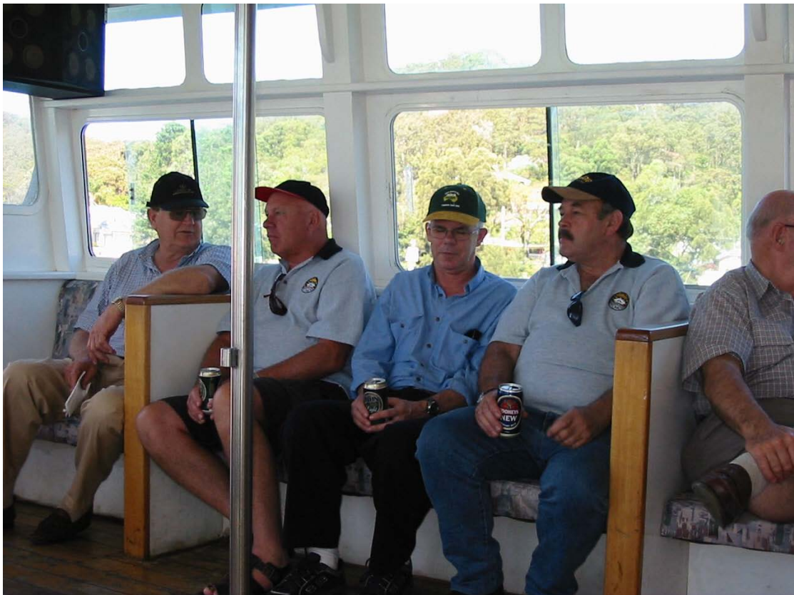
Enjoying someone else doing the driving