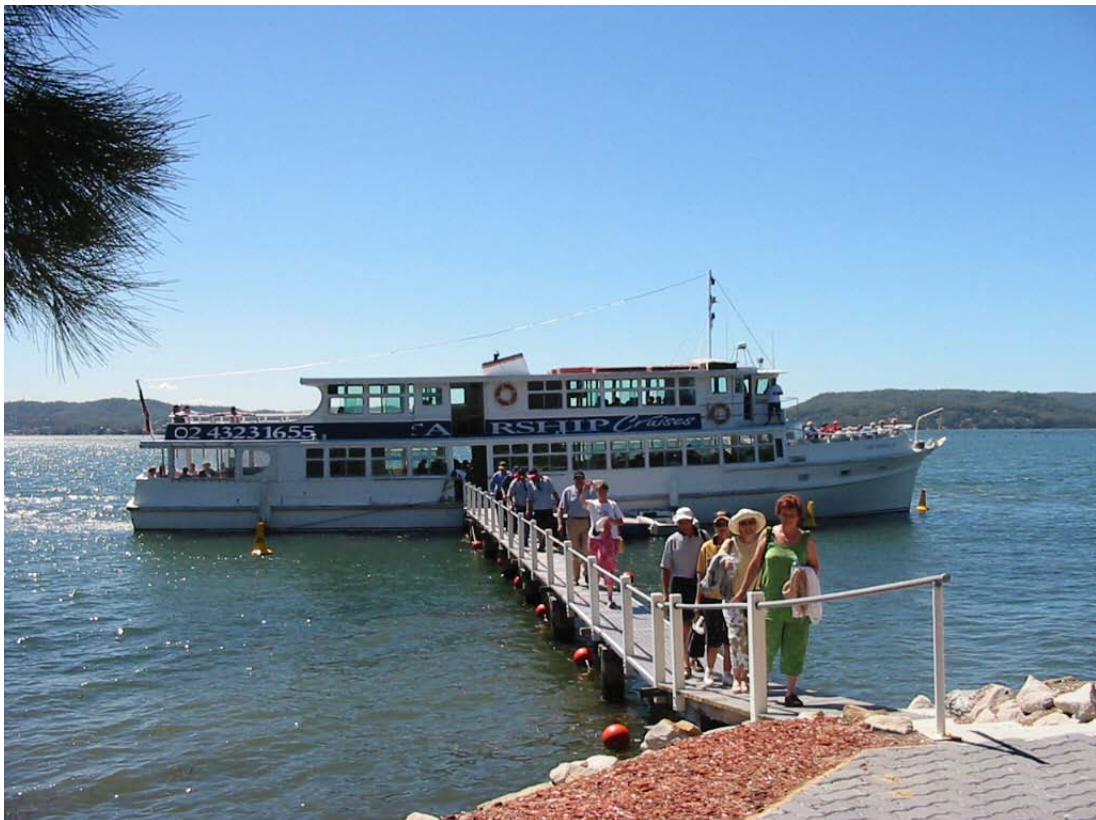
TSCC TAKES TO THE WATERS